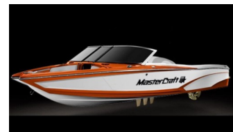
The team's new ProStar

Be sure to watch for the speedy orange ski boat, and don't be afraid to say hi!