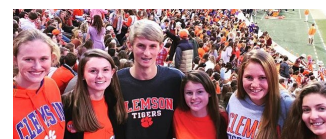
Fall 2016 Recruiting Weekend

The SAC better be ready for the Clemson Tigers!