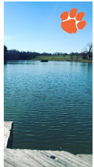
A photo of the lake at our first team practice of the Spring Season!